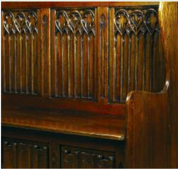
As seen with the antique bench above, Oak has long been used by furniture builders for its warmth, character and durability.