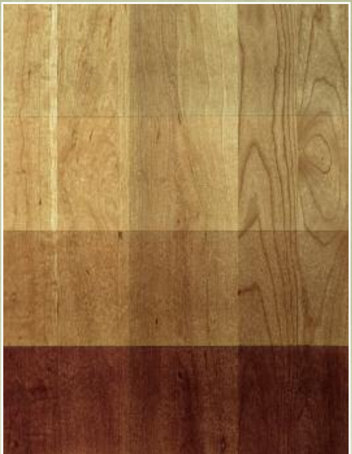
Four different stain colors are used to demonstrate the way Cherry will darken over time. Samples at left are original stain colors, the center column has begun to age, and the far right column has mellowed and taken on Cherry's distinctive patina.