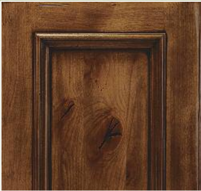
Alder is often paired with our standard and Artisan Distressing packages. Here, Rustic Alder is shown with Artisan 2 Distressing and Glaze.